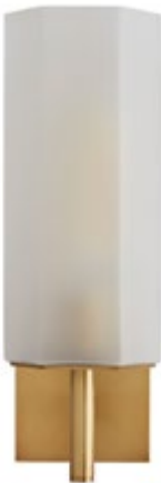
SOLOMAN SCONCE 49646