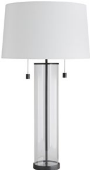
SAVANNAH LAMP 49878-867