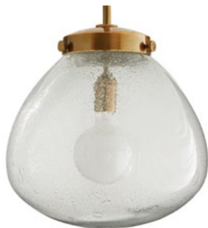
WELCH PENDANT 46413