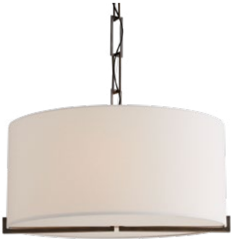
DRUM PENDANT DB49002