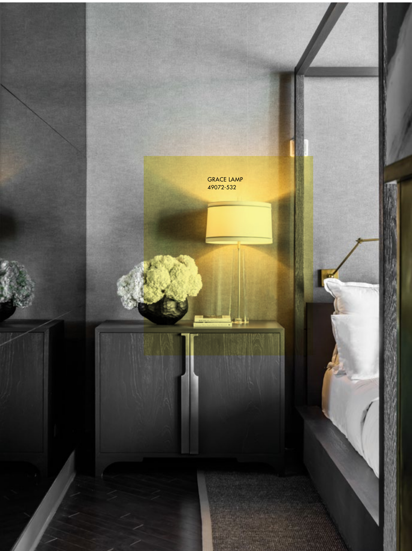
GRACE LAMP 49072-532