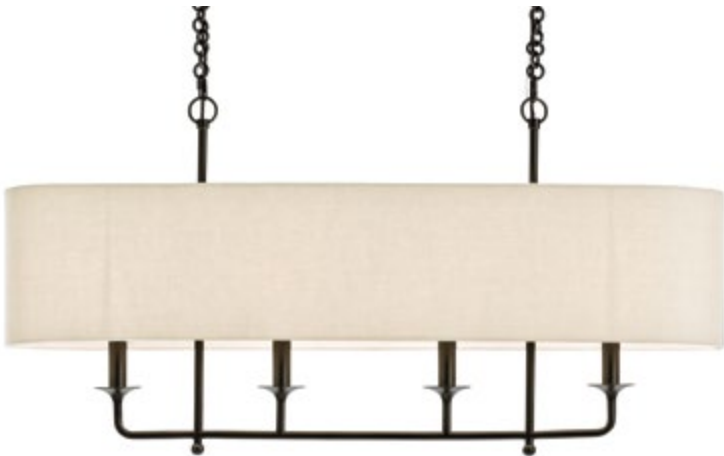
BEATTY CHANDELIER 89417