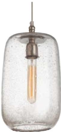
SHELTON CYLINDER PENDANT 46646