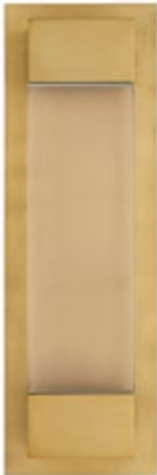
CHARLIE SCONCE 49368