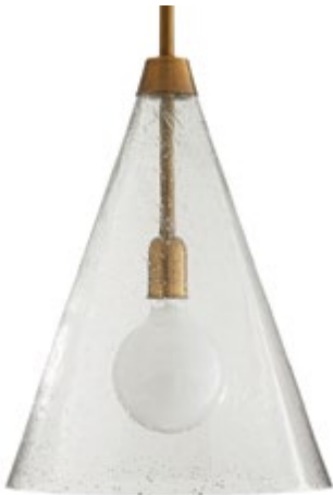
WEISS PENDANT 46426