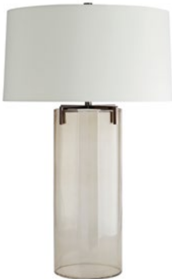
DALE LAMP 49351-735