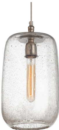
SHELTON CYLINDER PENDANT 46646