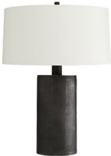
PRAGUE LAMP 44447-188