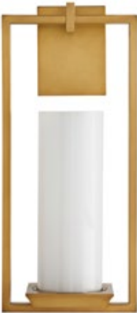
TRAPEZE SCONCE DB49013