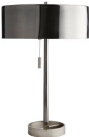
VIOLETTA LAMP 49651