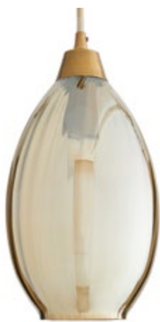
AMBER PENDANT 42490