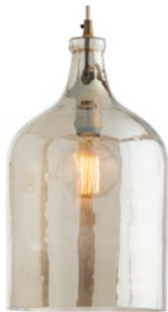
NOREEN PENDANT 44081