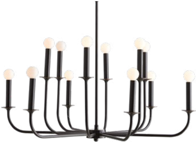
BRECK SMALL CHANDELIER 89344