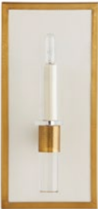
GRIFFITH SCONCE DP49003