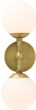
POLARIS SCONCE 49961