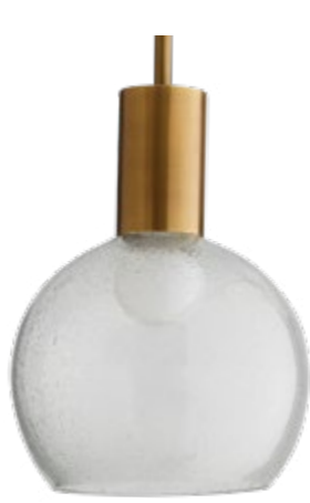
AVA PENDANT 44911