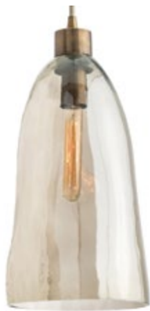
DOREEN PENDANT 44084