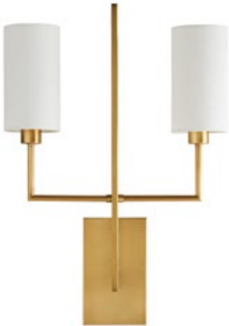
BLADE SCONCE DB49017