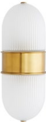
WINTHROP SCONCE 49250