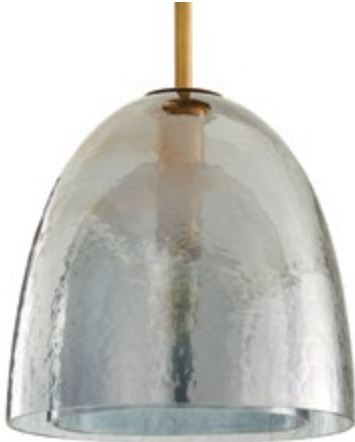
JENNA PENDANT 42247