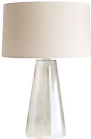
MITCH LAMP 44378-552