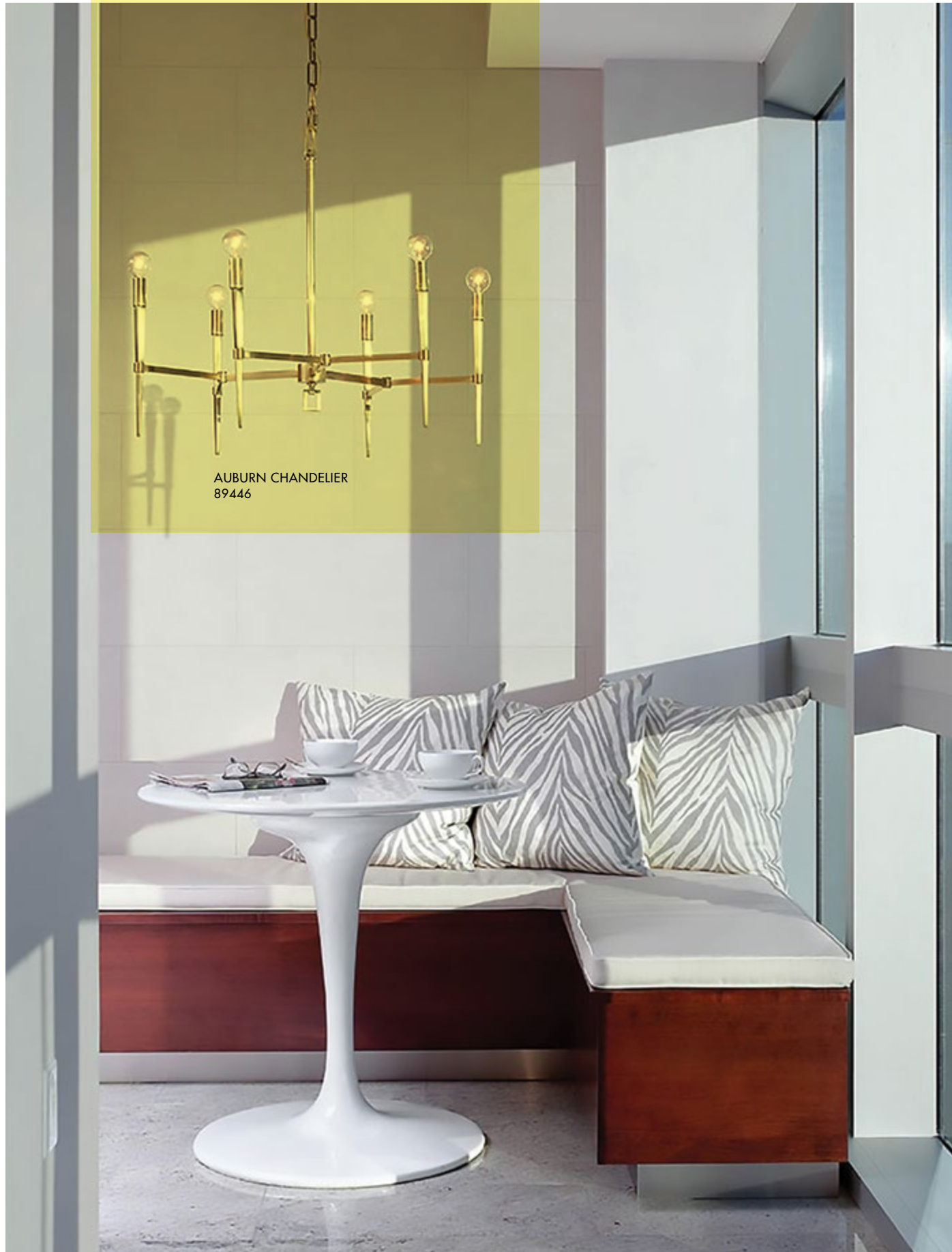
AUBURN CHANDELIER 89446