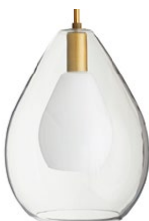
NALA PENDANT 49098