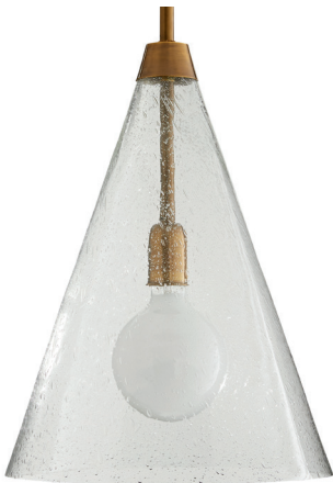
WEISS PENDANT 46426