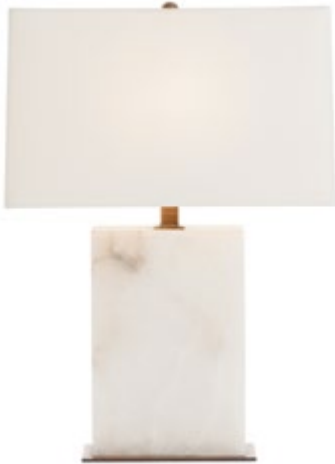
CARSON LAMP 42328-798