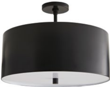
TARBELL SEMI-FLUSH 49267