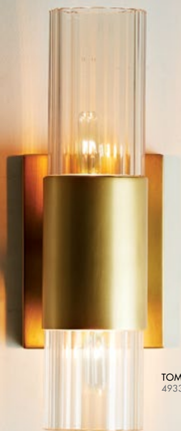
TOMPKINS SCONCE 49334

Enduring designs that fade into the background, allowing key pieces to shine.