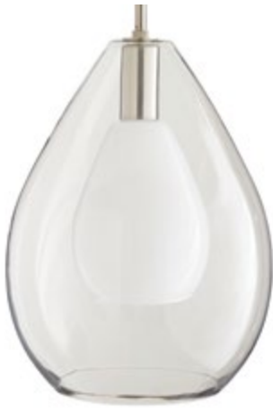
NALA PENDANT 49174