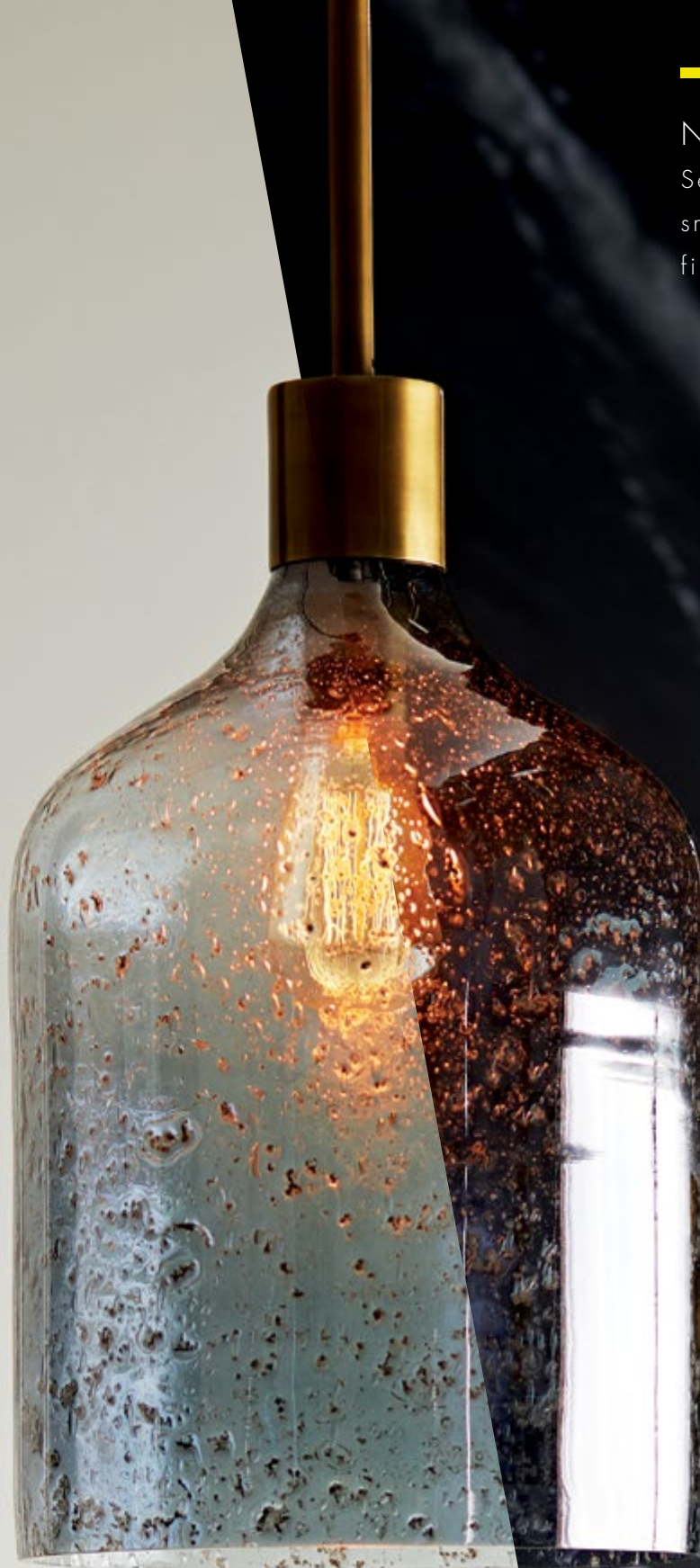
NOREEN PENDANT 44910

Seedy glass featuring a smoky blue tint with a luster finish & sleek brass canopy.