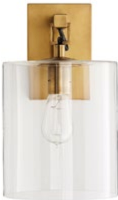
PARRISH SCONCE 49086