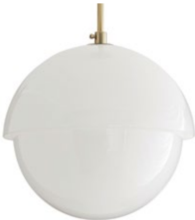
UNDERWOOD PENDANT 49253