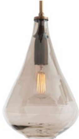
ALBERT PENDANT 44083