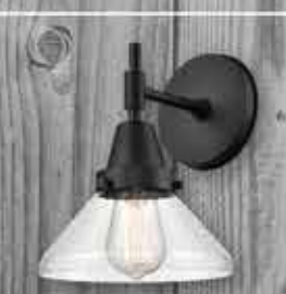
CADEN COLLECTION PAGE 28