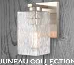
JUNEAU COLLECTION PAGE 23