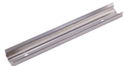
4" Mounting clips MLINK-CLIP-4