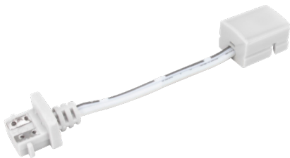
6" Linking cable MLINK-JUMP-6