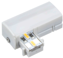
L - Connector MLINK-L (Left) MLINK-R (Right)