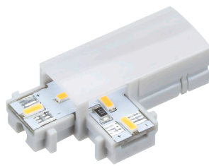
T - Connector MLINK-TL (In-line Left) MLINK-TR (In-line Right) MLINK-TM (End)