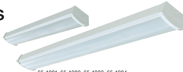
65-1081, 65-1082, 65-1083, 65-1084