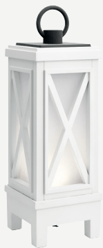
A | 49679 WHRLED Montego Lantern