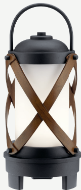
B | 49239 BKTLED Berryhill Lantern