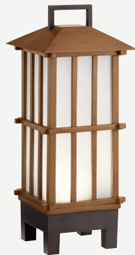
C | 49247 BWFLED Davis Lantern