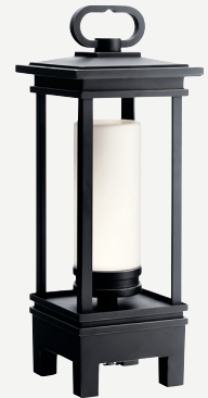
E | 49473 RZLED South Hope™ Lantern