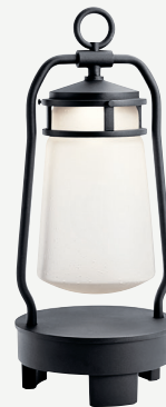
D | 49500 BKTLED Lyndon™ Lantern