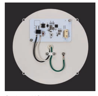
On-board IC drive technology no external driver needed