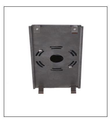
Simply screw the Blink universal mounting plate to the junction box.