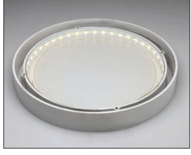
Edge-lit design eliminates hot spots and provides even light output