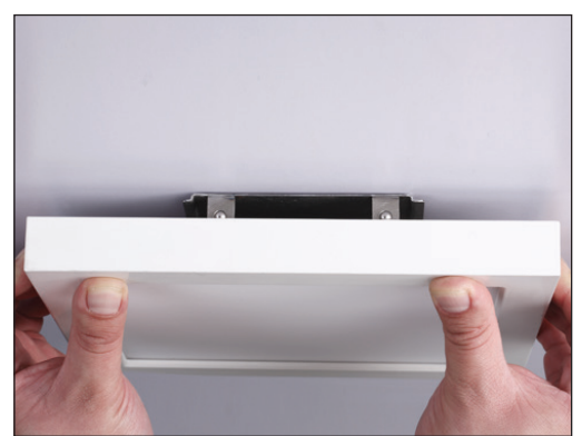
Snap Blink onto the mounting plate.