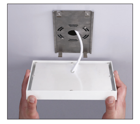
Make your connections using the quick connect included, and lift into place.